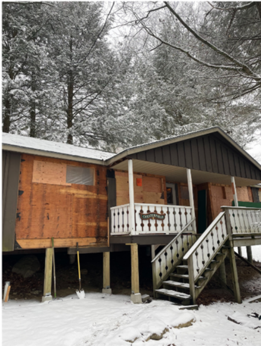
Chesterfield → Girl's Staff Cabin

The Something New Campaign launched in 2022 with a goal of raising $1.25 million over two years to support the construction of a new Girl's Staff Cabin and a new Family Lodge. In addition, the campaign is supporting $200,000 worth of upgrades to the property and $50,000 of seed money for future ministry the Camp is pursuing. Here are the details of both the fundraising and schedule of work over the next year: