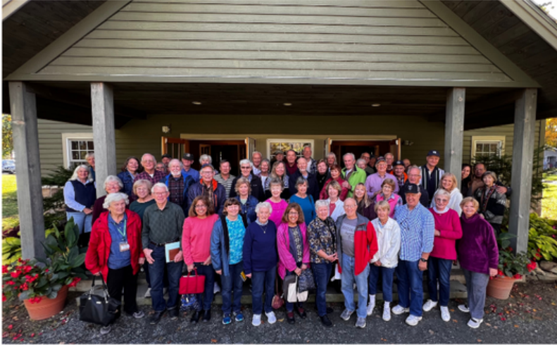
Fall Foliage Retreat

This fall retreat season was certainly one for the books! Between our Men's, Women's, and Fall Foliage retreats, we served nearly 500 guests. That's an increase of almost 70 people compared to last year's fall retreats. The numbers say it all! God is continuing to use Camp Spofford to change lives and connect people both to Himself and to one another. Here's one of my favorite quotes from our Women's retreat: "[The retreat] really encouraged me to love others more fully and step away from the sidelines that I cling to. I left feeling convicted to be saturated in Scripture and more earnest in prayer, and more intent in talking with others around me about their lives and about Christ!" It was an amazing season, and we are so thankful for the work God has done.